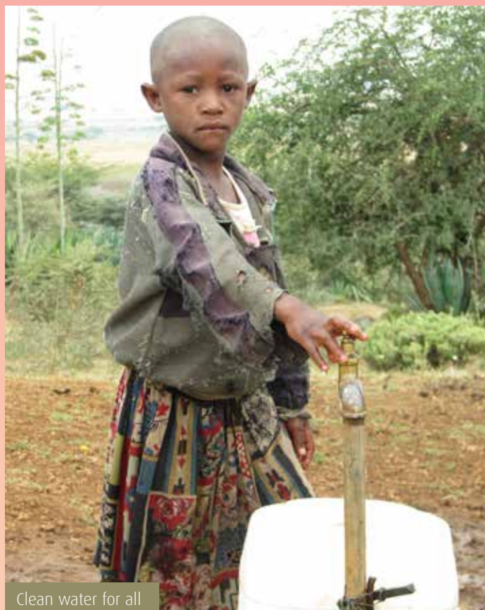
Clean water for all

We managed to return to Olarash primary school which we focused on last year. This was lovely as we were able to see with our own eyes whether our hard work had survived the year! All the painting was intact (albeit a little dusty!) and the water was still running down to the school through the pipe for which we had dug a trench. We helped them this year by painting their blackboards, and moving concrete blocks. I can say with confidence that the money we raised this past year alone has made a noticeable visual difference to all the areas, schools and people which the Monduli Green project serves.”