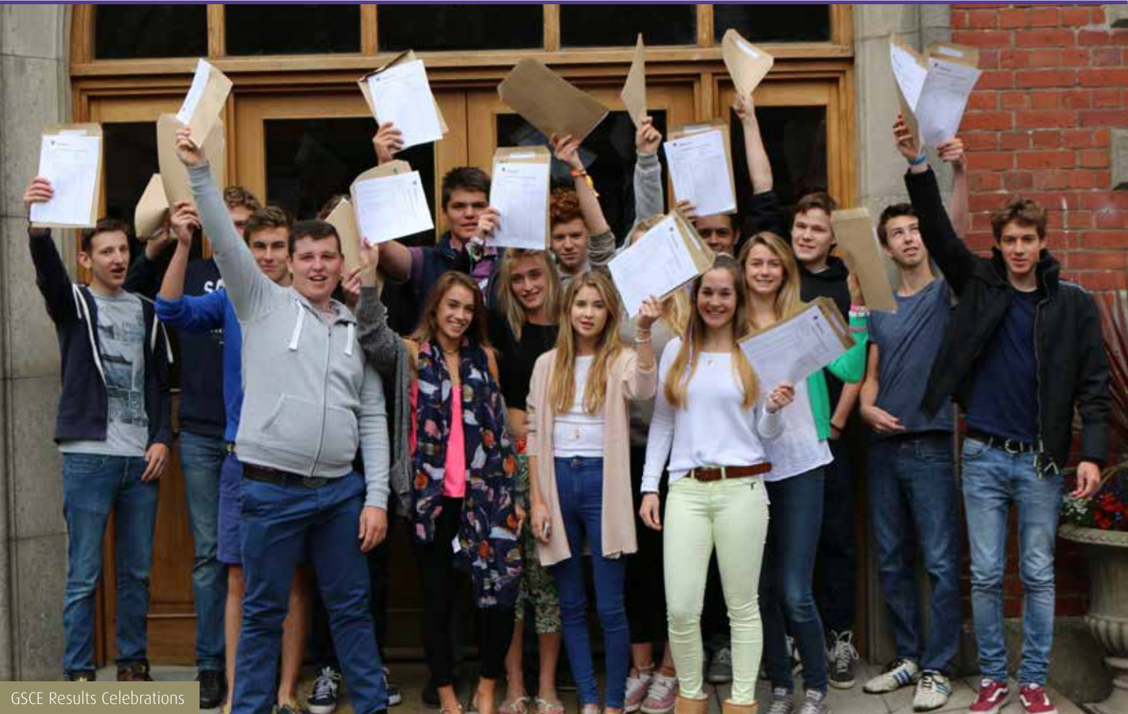
GCSE Results Celebrations

The first results of the summer were those of the International Baccalaureate Diploma, where our students' average overall score equated to three A grades at A Level. As a challenging alternative to A Levels the IB requires students to study six subjects, a course in the Theory of Knowledge, and produce a university standard Extended Essay as part of their assessment.