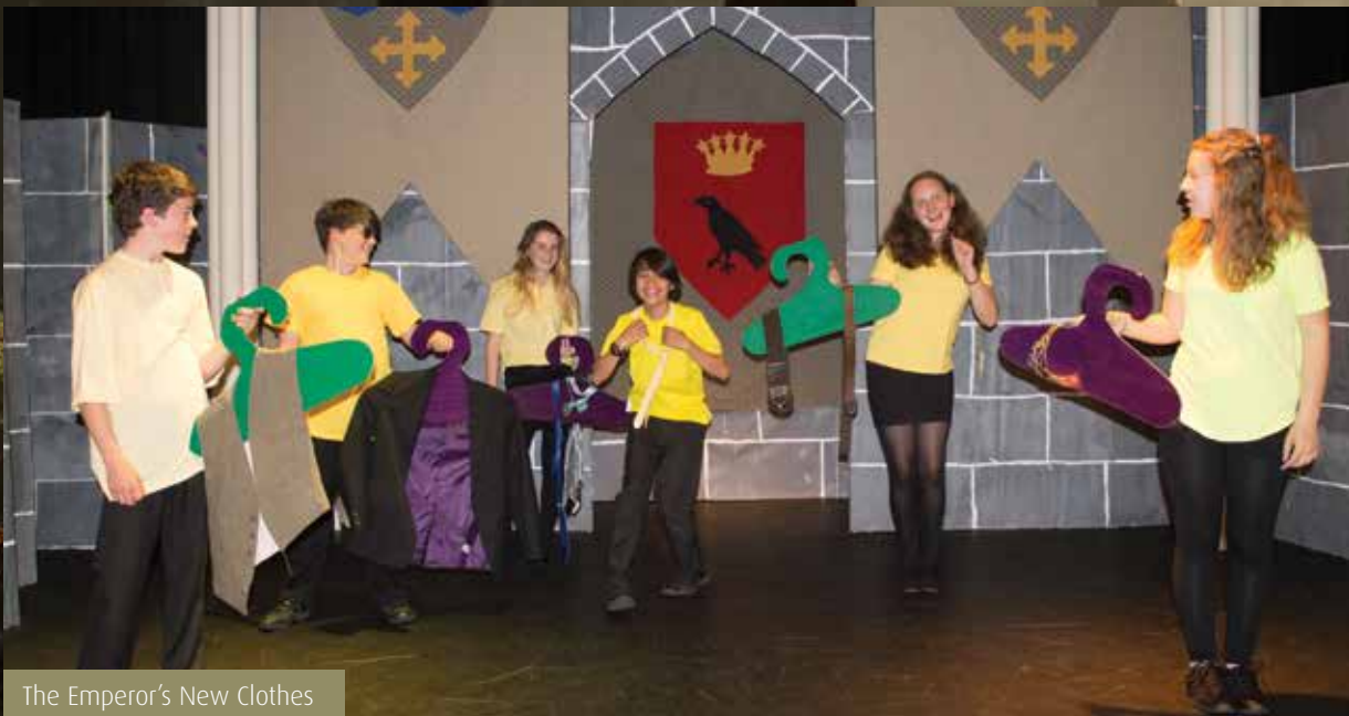
The Emperor's New Clothes

The large cast for the plays produced an exuberant and entertaining show over two nights in the Arts Centre Theatre, where they demonstrated a wide range of theatrical talent and acting techniques as well as some excellent technical skills in lighting, costume, prop making and makeup. They also clearly had great fun, and there was a real sense of celebration of the fun of making theatre together. Well done to all who took part!