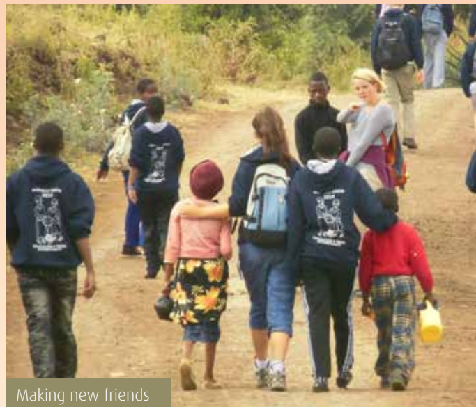
Making new friends

It was on Monday when the work really began with our first trip to Mti Mmoja Primary School where we later painted classrooms, prepared seed pots which the pupils of the school will later use as part of their tree-planting project, and dug a trench over which a staff toilet will later be constructed.