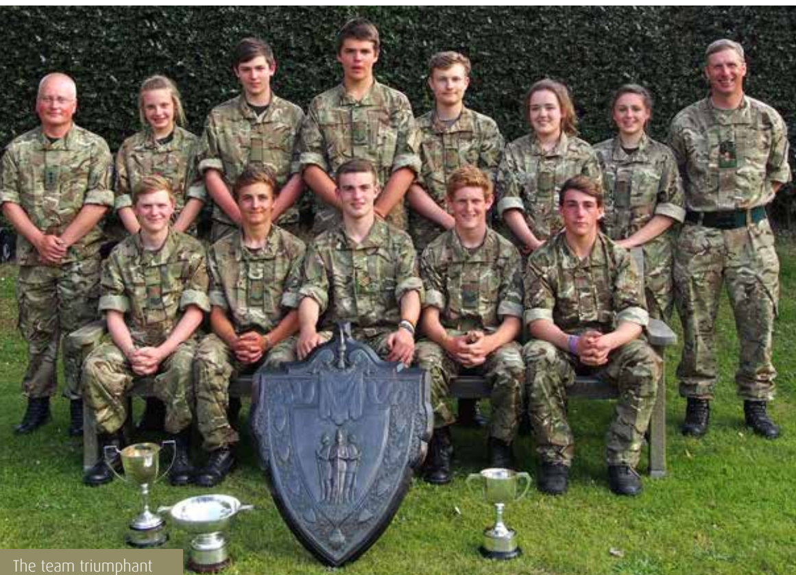
The team triumphant

The Shooting Academy has continued to improve its standard of competition with several members achieving representational honours at British Schools and Junior National level during the past year. Well done to all our shooters and their dedicated coaches.