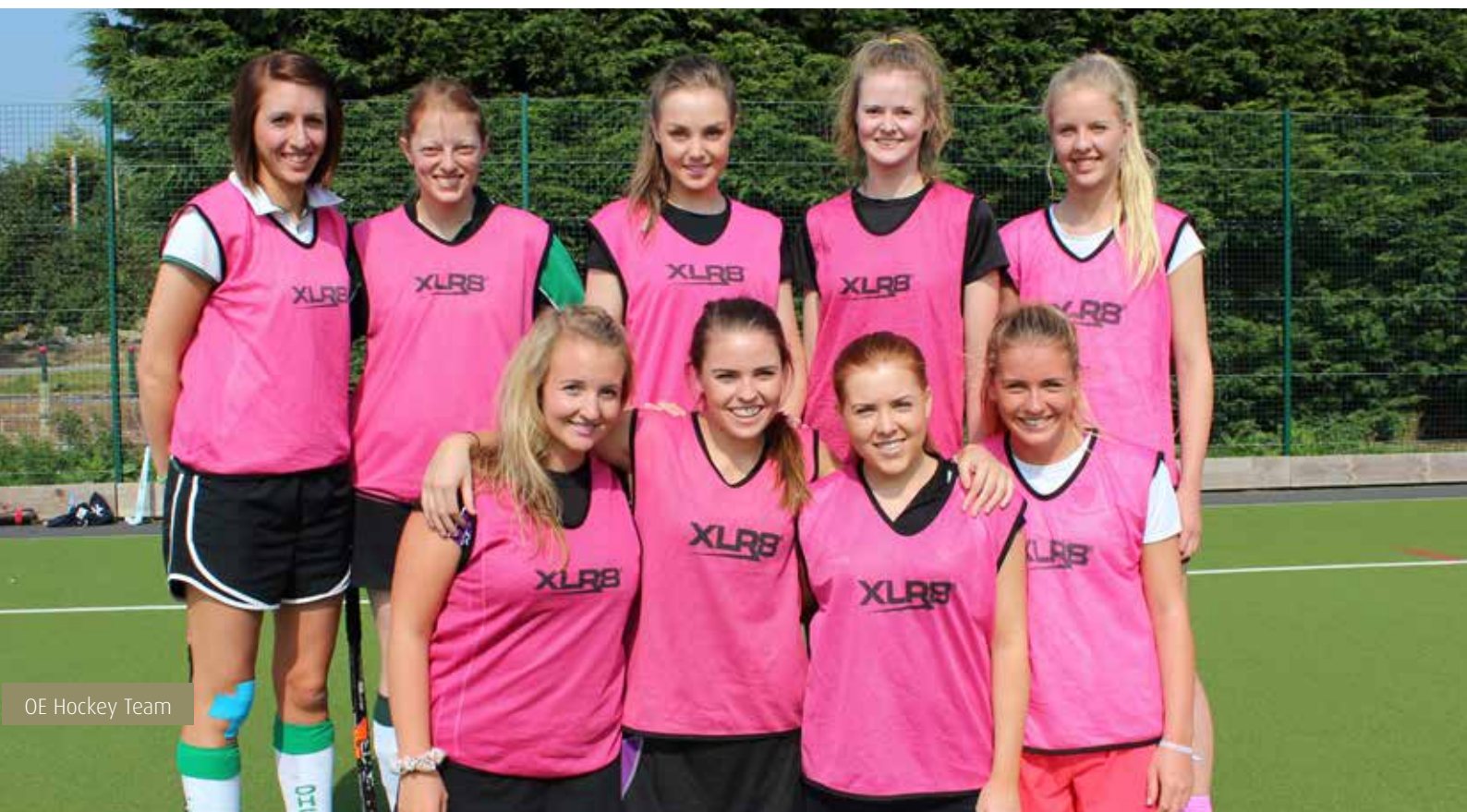
OE Hockey Team