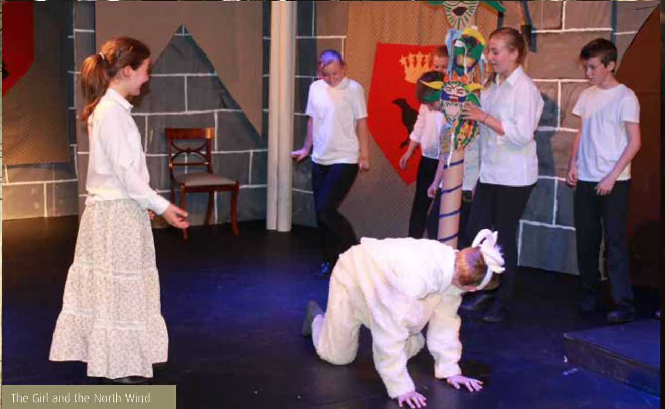
The Girl and the North Wind